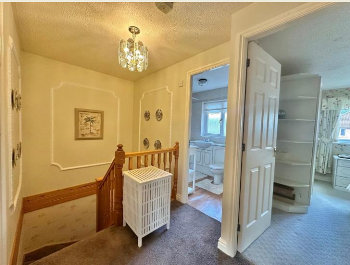
BEDROOM THREE 9'3 x 8'10