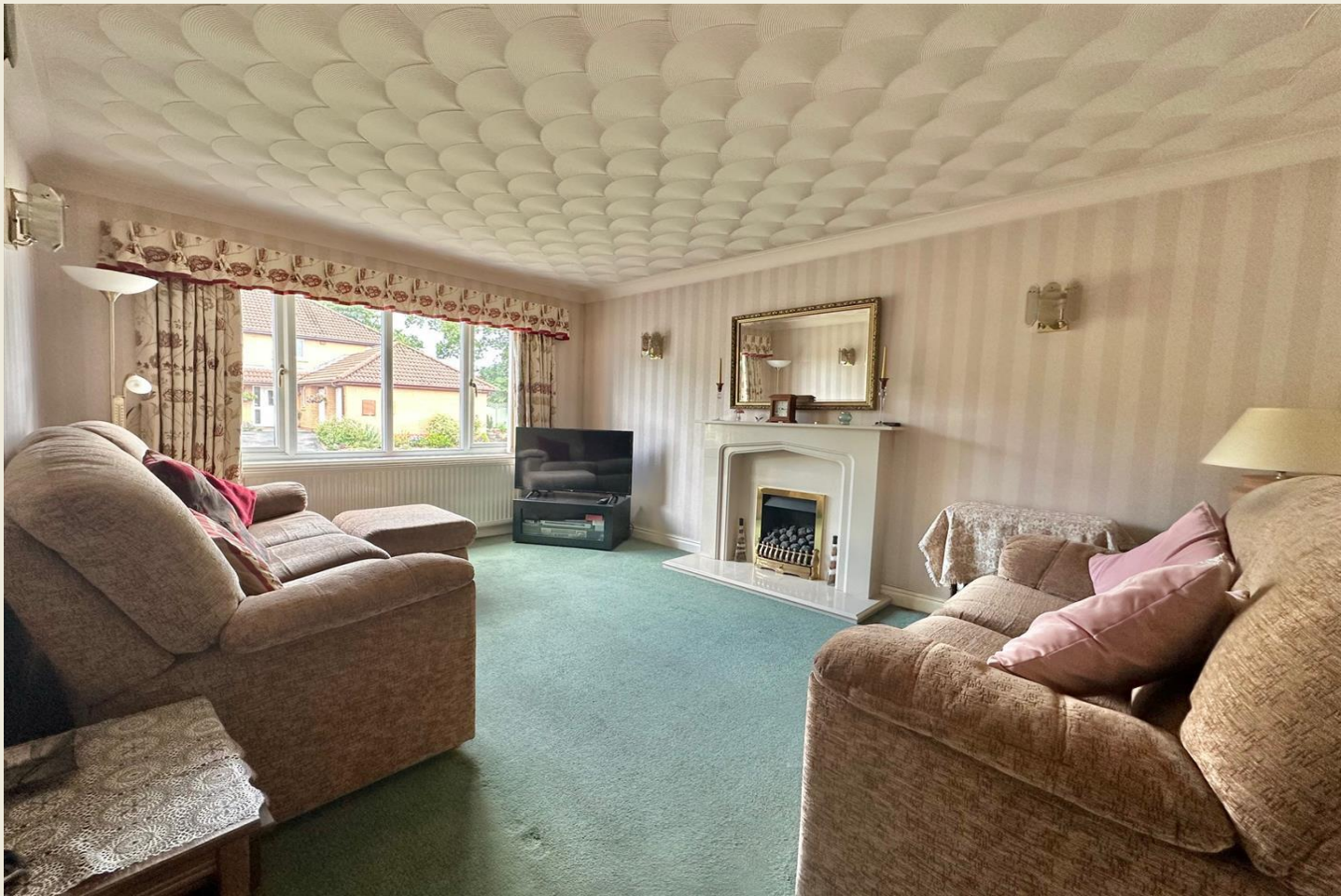
LIVING ROOM 14'9 x 10'8