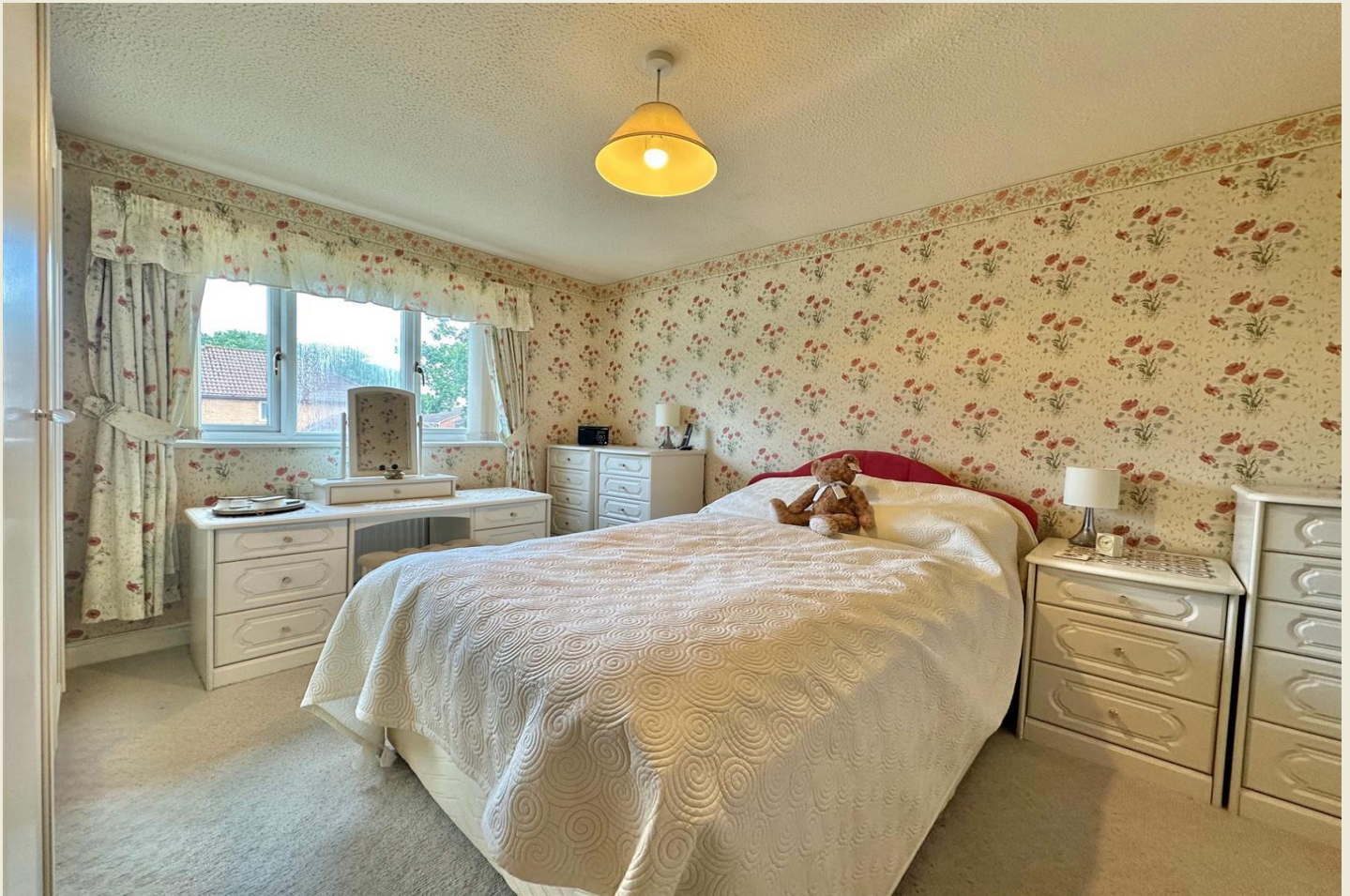
MASTER BEDROOM ONE 12'8 x 10'8